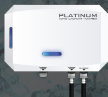
Platinum Ionic Laundry Ozonation Purifier

The Source H2O products shown here represent the major lines that we have developed—with the goal of resolving any contaminant issue you may have in your water. The benefits and solutions that each product delivers, vary depending on the problem and intended application. Once our Water Experts are able to test the water in the home, The Source H2O will suggest the best appropriate configuration.