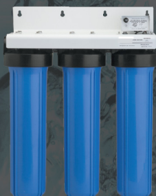
Nero UV Ultraviolet Disinfection System

Upflow Regeneration drives the hardness minerals up through the already depleted resin and out to drain - saving both salt and the unused portion of the resin for future use.