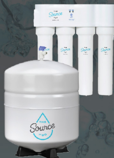
Nero Pure® Reverse Osmosis Drinking System