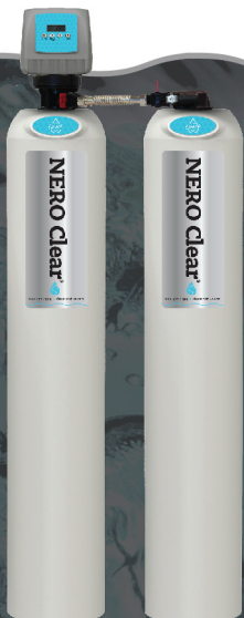
Nero Clear® Four-In-One Home Clarifying System