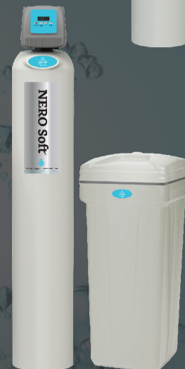
Nero Soft® Three-In-One Hybrid Softener

Give our Water Experts a call at 888-412-4334 and let us help you make your home the source of clean, healthy, great-tasting water.