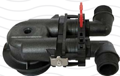
NRV valve (Non-Regenerating Valve) Remove Disinfectants From Your Water