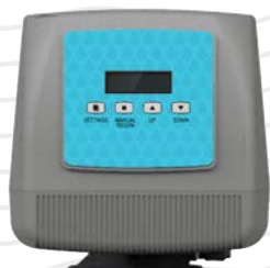
Optional 785 High-efficiency backwash valve